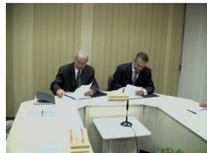
Abdel Salam Mahgoub and Magued Osman

In a meeting headed by the Minister of State for Local Development, and IDSC's Chairman, a MOU was signed between the Ministry and the Center. The MOU's importance stems from the fact that the Ministry, which is nowadays highly concerned with revolutionizing its work mechanisms to cope with the information era, will gain access to IDSC's experience in this regard.